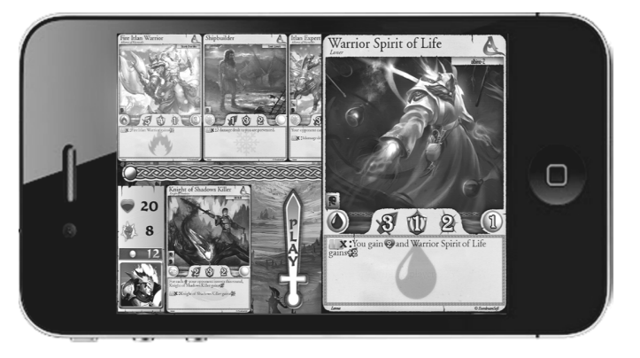
Fig. 1. Moonga Battle

By integrating the GeoGuild framework, Moonga will allow players to form geolocated guilds. They will be able to share