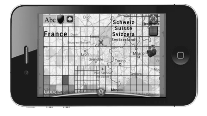
Fig. 2. Moonga Territories

cards with the guild members and to play tournaments against other guilds.